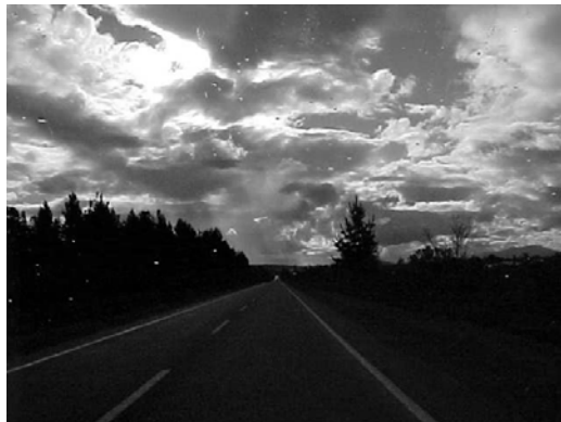
Somewhere near Villarrica Lake, southern Chile

Any artistic manifestation that is supported by the will of order, beauty and nobility, beyond its époque and style, can be included in my list of "influences". As this statement leaves us in a wide range of possibilities, let's be a bit more precise: Bach's "Musical Offering" could be a good example. I grew up listening to this and other classical stuff, in a remote place of southern Chile, surrounded by lakes, volcanoes, and the most beautiful skies I've ever seen, so I think this context has influenced Der Arbeiter's music (and my work as an architect), which primary wants to express this will of harmonic structures, an Apollonian sense of order and unity.