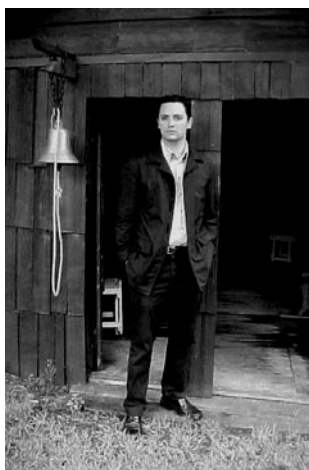
In Valdivia, Ur-Heimat, Chile, 2001

Of course yes. Everybody has an identity, understood as a "distinctive form", but to be aware of it, i.e. to be a Conscious Being, aware of his inner Identity ...this is completely different. As long as you understand this, you understand your destiny and duty in life. In order to achieve this goal, I think that the